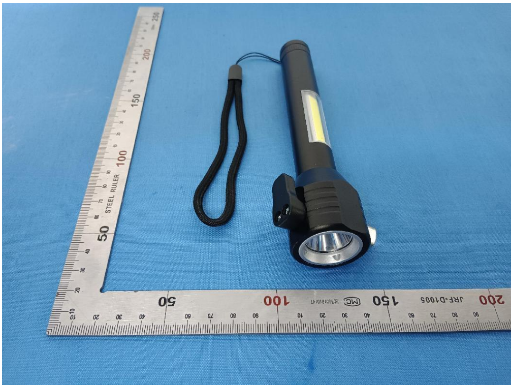
Fig.2- Parts view

Any report having not been signed by authorized approver, or having been altered without authorization, or having not been stamped by the “Dedicated Testing/Inspection Stamp” is deemed to be invalid. Copying or excerpting portion of, or altering the content of the report is not permitted without the written authorization of AGC. The test results presented in the report apply only to the tested sample. Any objections to report issued by AGC should be submitted to AGC within 15days after the issuance of the test report. Further enquiry of validity or verification of the test report should be addressed to AGC by agc01@agccert.com .