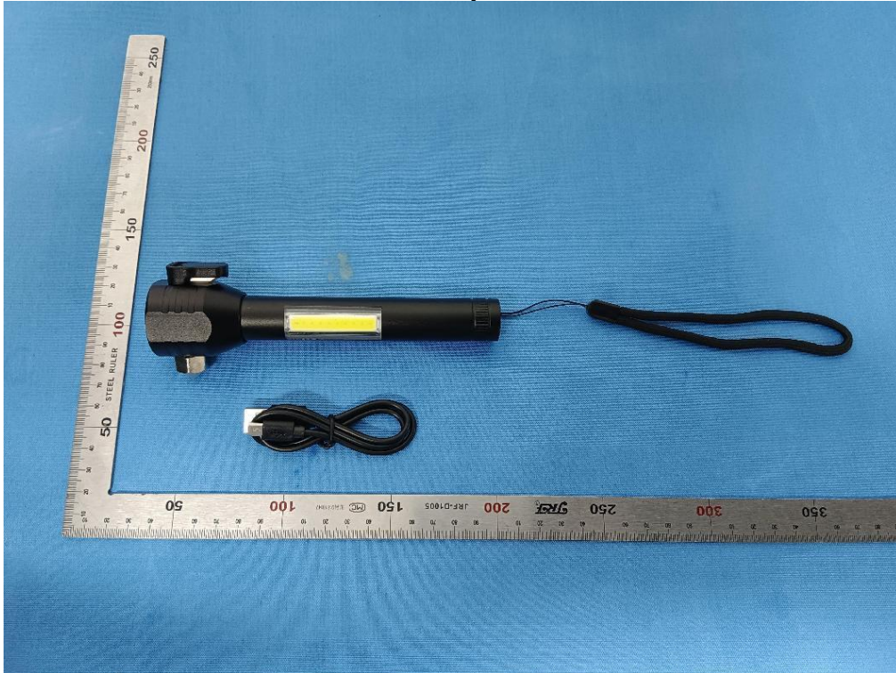
Fig.1- Overall view