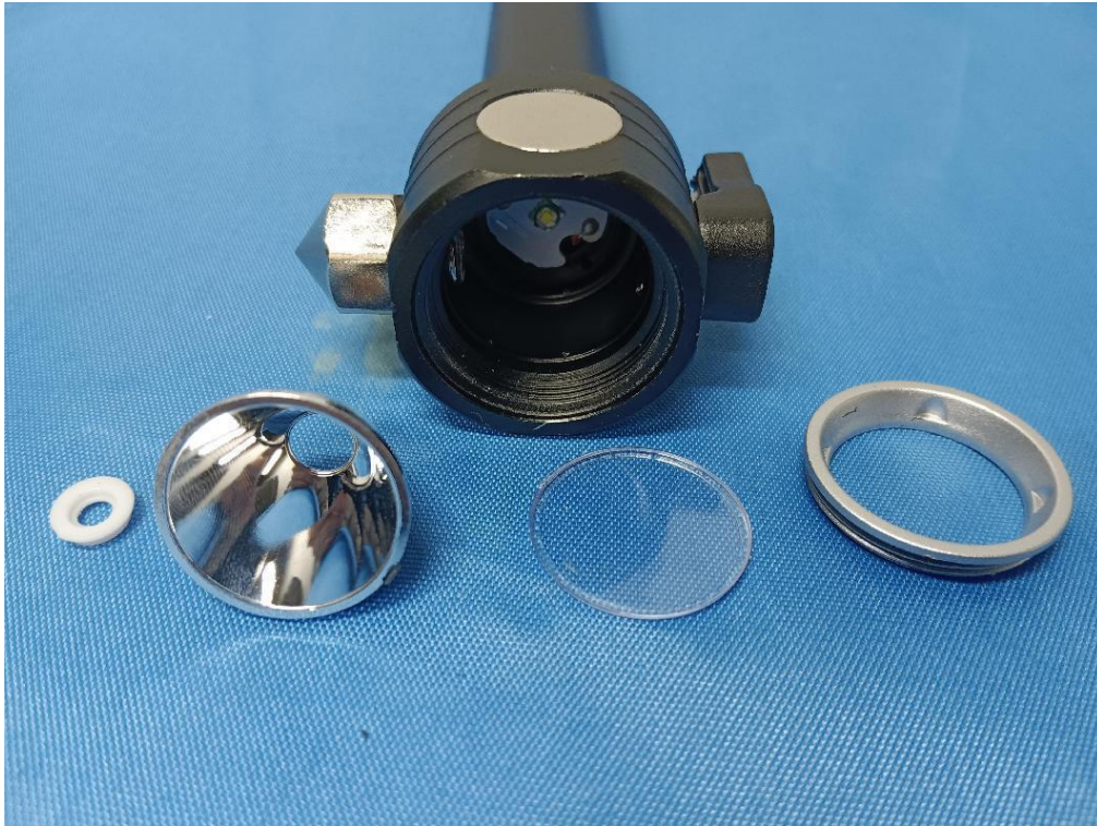
Fig.3- Parts view