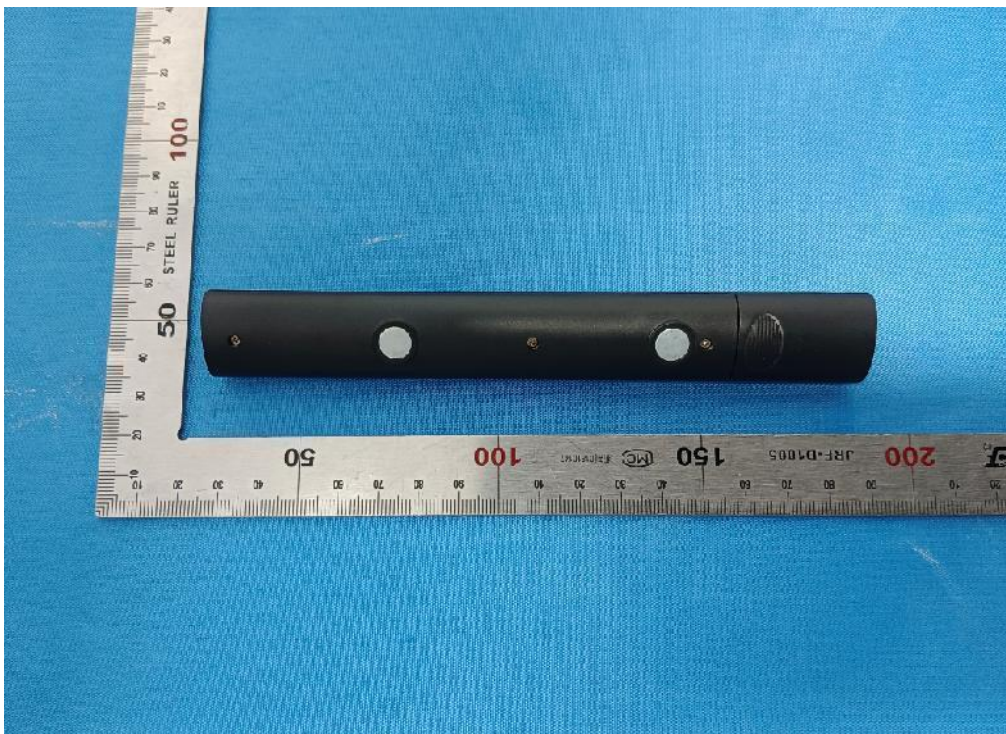
Fig.2– Overall view of the product

Any report having not been signed by authorized approver, or having been altered without authorization, or having not been stamped by the “Dedicated Testing/Inspection Stamp” is deemed to be invalid. Copying or excerpting portion of, or altering the content of the report is not permitted without the written authorization of AGC. The test results presented in the report apply only to the tested sample. Any objections to report issued by AGC should be submitted to AGC within 15days after the issuance of the test report. Further enquiry of validity or verification of the test report should be addressed to AGC by agc01@agccert.com .