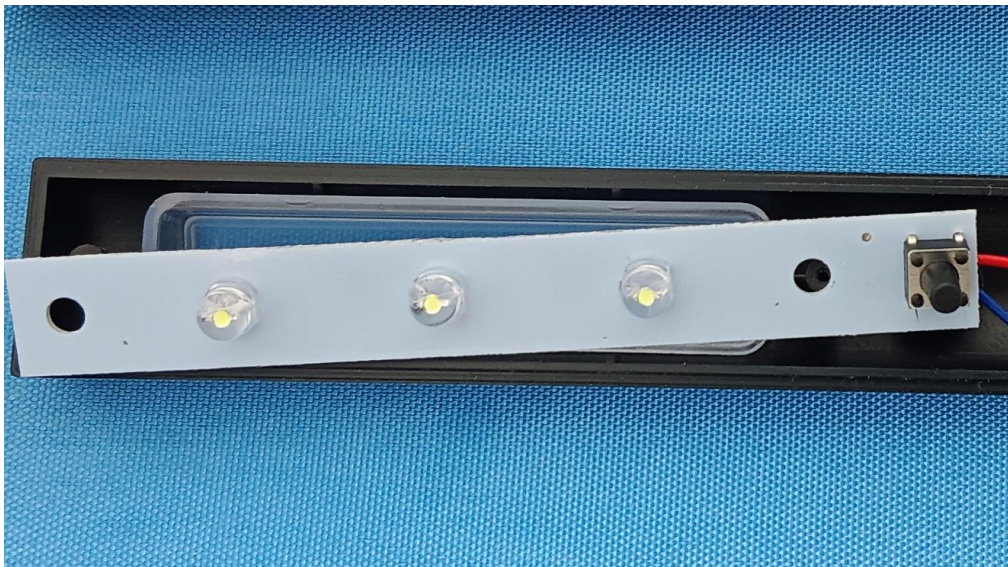
Fig.4– LED view of the product