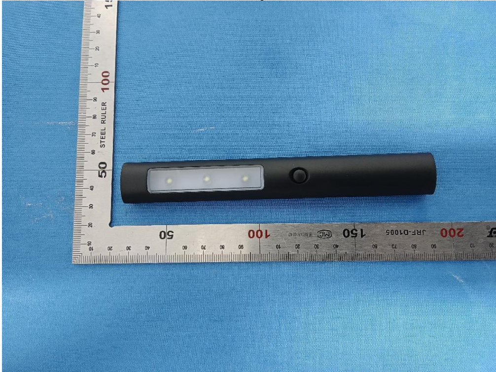
Fig.1– Overall view of the product